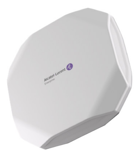
OmniAccess Stellar AP1321 indoor Wi-Fi 6 access point