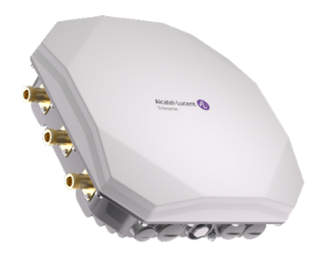
OmniAccess Stellar AP1361 outdoor Wi-Fi 6 access point

Wireless connectivity plays a huge role in boosting that experience. From status updates sent to a traveler's mobile device to automated ticketing, check-in, safety and security. Travelers are used to being able to connect from almost anywhere, and this must extend into the transportation experience.